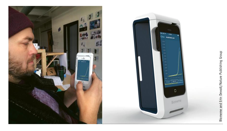
Biomeme's portable PCR device, currently with researchers for beta testing, docks into the iPhone.

outbreaks, he says, miniPCR will help him and others detect whether water is contaminated.