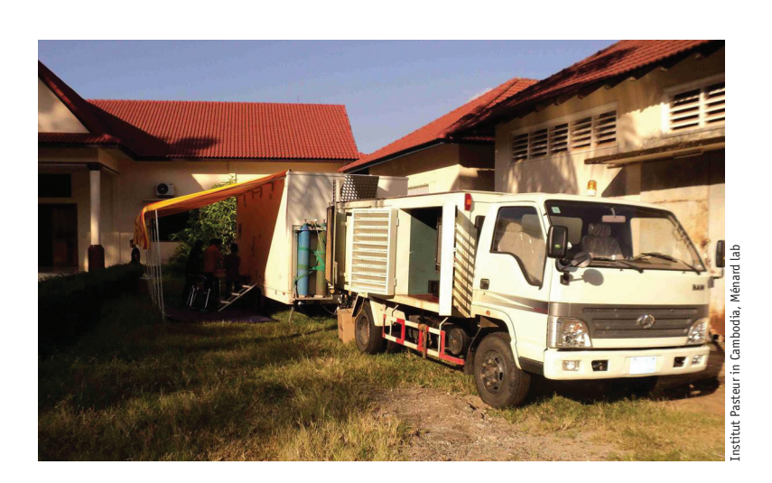
Scientists at Institut Pasteur in Cambodia designed a mobile lab that can be towed to remote villages to quickly detect malaria in many people.

But malaria remains difficult to eradicate, for many reasons. Even when transmission of the parasite Plasmodium via its mosquito vector is much lowered, for example in Cambodia, a parasite reservoir remains. This reservoir is in infected but asymptom-